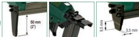
Versione SL - SL model